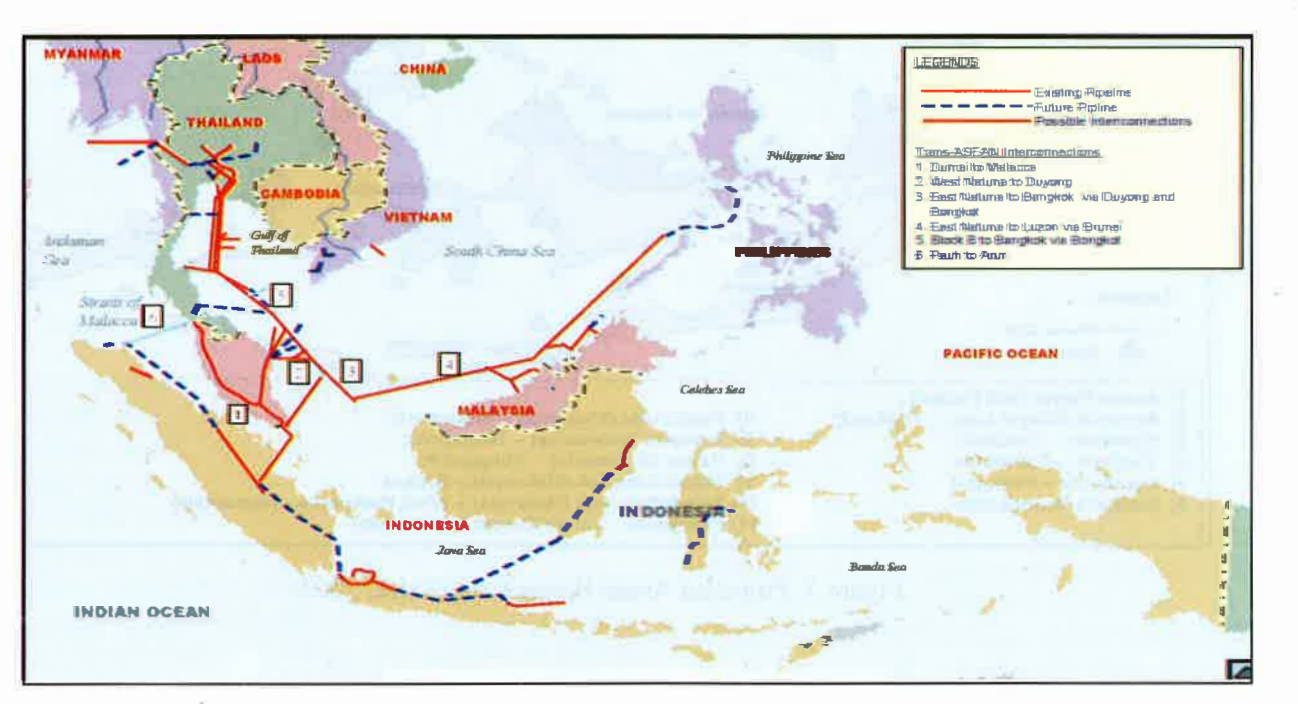
Figure 4. Proposed Trans Asean Gas Pipeline (Balce, 2003)

As a result of the oil crisis of the 70's and 80's ASEAN countries have pursued programs to reduce oil consumption and increase natural gas use (Balce, 2003). In 1997, the ASEAN vision 2020 included the Trans ASEAN gas Pipeline (TAGP) among its major infrastructure projects to secure the availability of natural gas in the demand centers of the region (Balce, 2003). The development of CBM industry in Indonesia is benefited by proposed TAGP and ASEAN Power Grid. Indonesia CBM can supply the natural gas