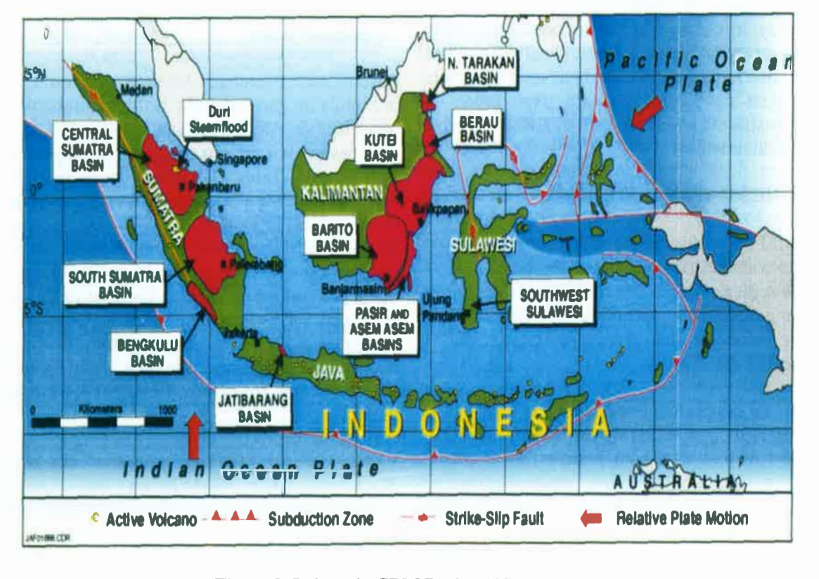
Figure 2. Indonesia CBM Basins (ARI, 2003)

CBM producibily is controlled by gas content, depositional setting, tectonic setting, hydrodynamics and permeability (Scott, 1997), which are specific to each coal basin. Although recent survey has identified and characterized some coal basins to be highly prospective, this survey is only a preliminary study. It means that detailed geologic evaluation for each basin is still needed, in order to find sweet spots for CBM development in those basins.